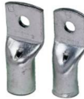
Copper Tube Terminals